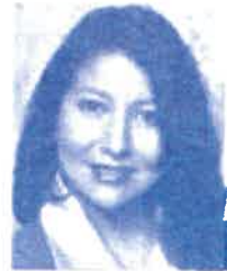
María Veloz Latino Children's & Family Literacy

Partnerships for Children: The Opportunities Created by Universal Preschool