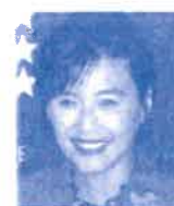
Judy Chu , Board Member California Board of Equalization, 4th District