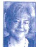
Alma Flor Ada Santillana USA